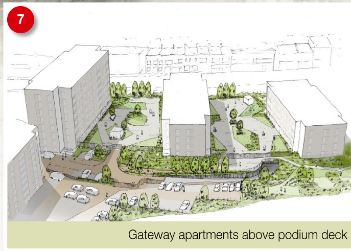
Gateway apartments above podium deck