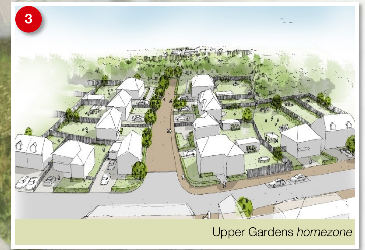
Upper Gardens homezone

This illustrative masterplan shows planting at a mature stage of approximately 25 years in growth.