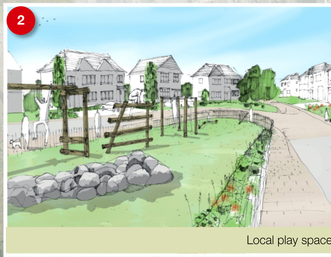
Local play space

This illustrative masterplan shows planting at a mature stage of approximately 25 years in growth.