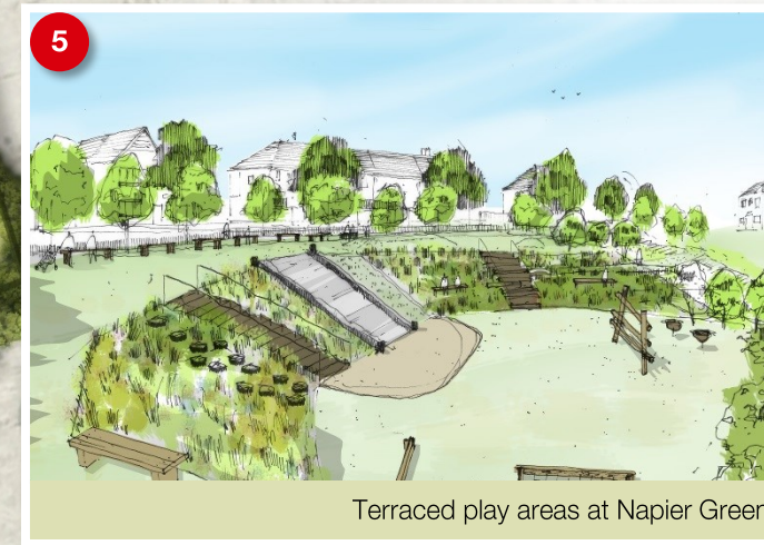
Terraced play areas at Napier Green