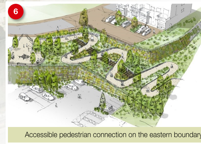
Accessible pedestrian connection on the eastern boundary